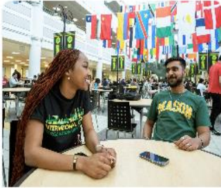
Academic Planning & Registration