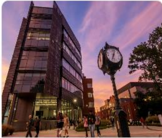
Exploratory Academic Advising