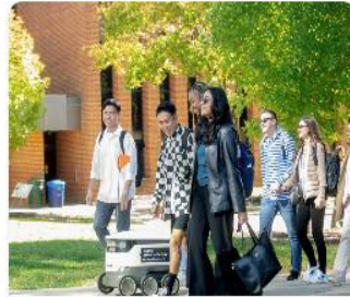
Transfer Student Advising