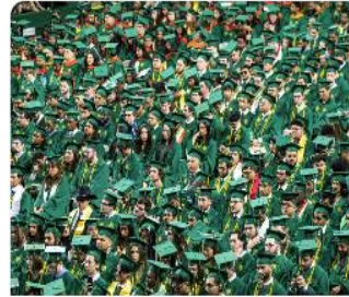
Change of Major