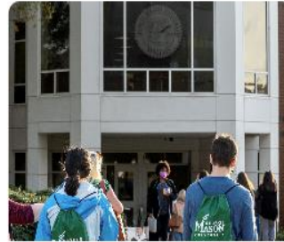
Non-Degree Student Advising