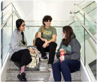
First-Year Student Advising