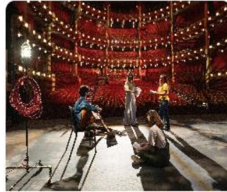
Majors and Minors: Explore, Change, Add