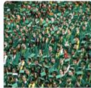
Change of Major