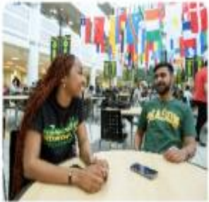
Academic Planning & Registration