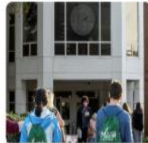
Non-Degree Student Advising

Patriot Connect – Complete Student Support (Academic Advising/Success Coaching)