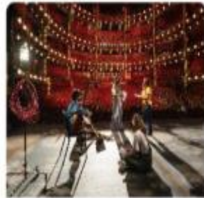
Majors and Minors: Explore, Change, Add