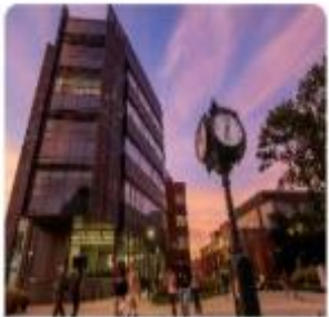
Exploratory Academic Advising