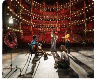
Majors and Minors: Explore, Change, Add