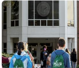
Non-Degree Student Advising