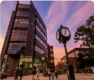
Exploratory Academic Advising