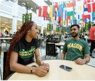
Academic Planning & Registration