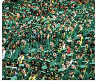
Change of Major